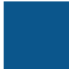
royal blue 028