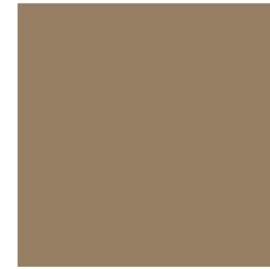
light brown 026