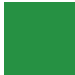
light green 032