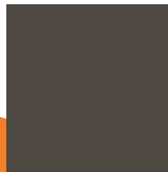
modern olive 035